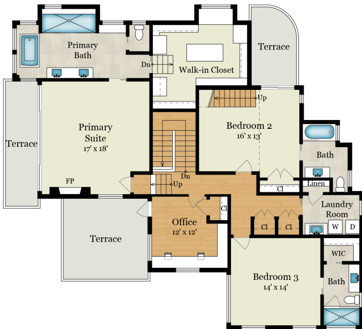
UPPER LEVEL 1,910 SQ FT