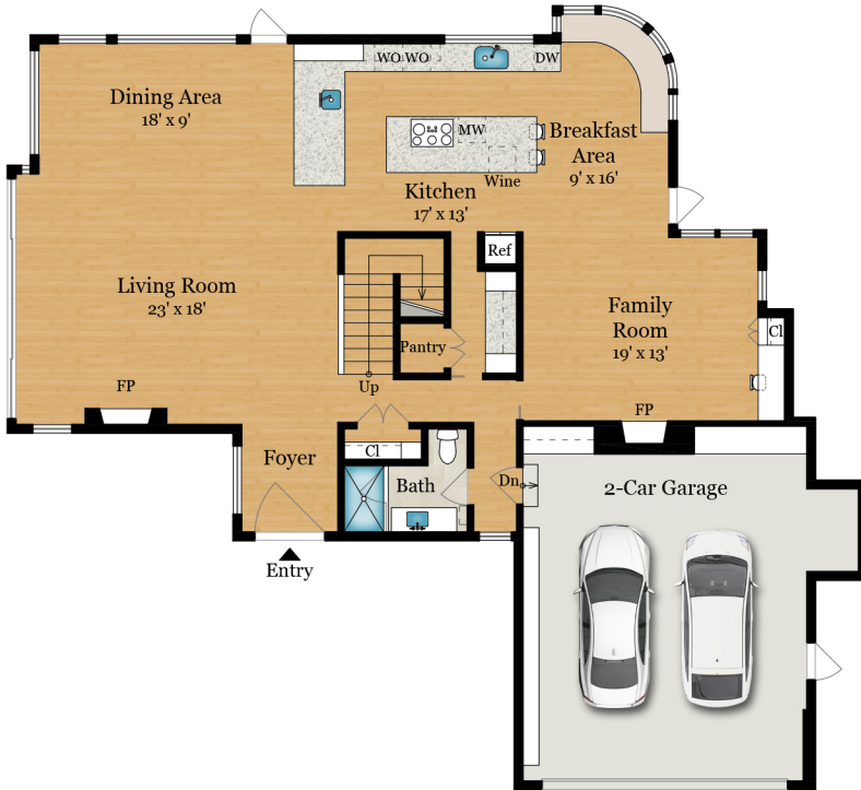
MAIN LEVEL 1,615 SQ FT